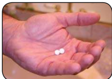
Take medications as instructed