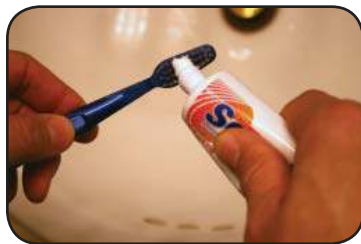
Use desensitizing toothpaste

Now that we've placed your permanent inlay or onlay, it is important to follow these recommendations to ensure its success.