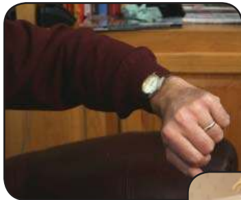
Do not chew for 30 minutes

It is not a problem for a small portion of a temporary filling to wear away or break off, but if the entire filling wears out, or if a temporary crown comes off, call us so that it can be replaced.