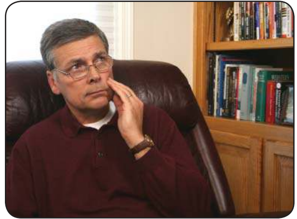
Wait for numbness to wear off completely